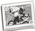
Pack of 12 stickers £10.49