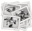
12 stickers 99p each

Ally buys a pack of 12 stickers for £10.49